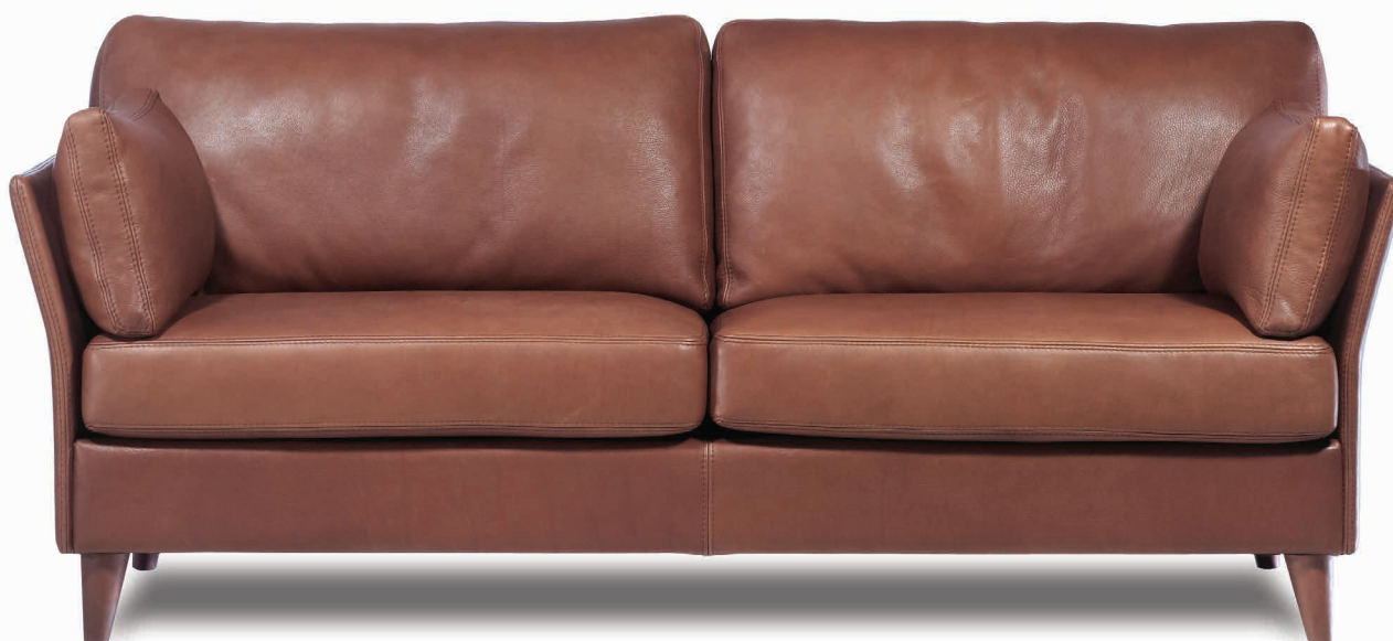
3 seater sofa Leather: Poney Grain de café pieds gainés cuir