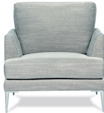
Archmair fabric Chandra AA2, Chromed steel feet